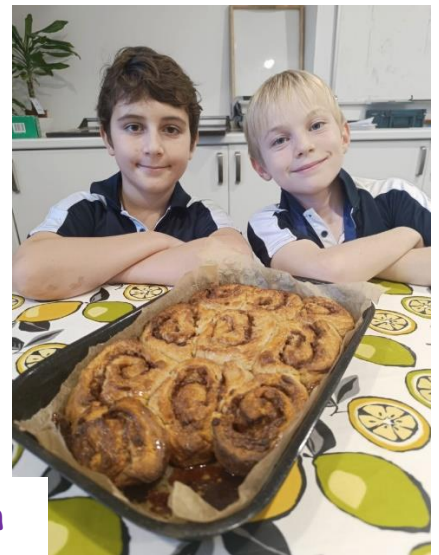
Cookery Club's yummy cinnamon