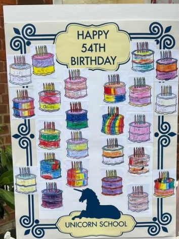
Beautiful card made by Yellow Class

Happy birthday Unicorn School - 54 today!